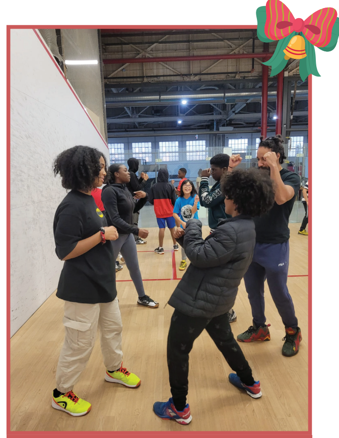
Youth at Urban Squash in Toronto learn fundamentals of boxing from Coach Ryan.

Both Harbord Collegiate and West Humber have already signed up for programs in their second semester and Urban Squash Toronto is hoping for some longer-term programming using the Level Up model. We have served almost 150 students so far with Level Up alone. Students from all programs have thanked us for both the physical component as well as the resiliency