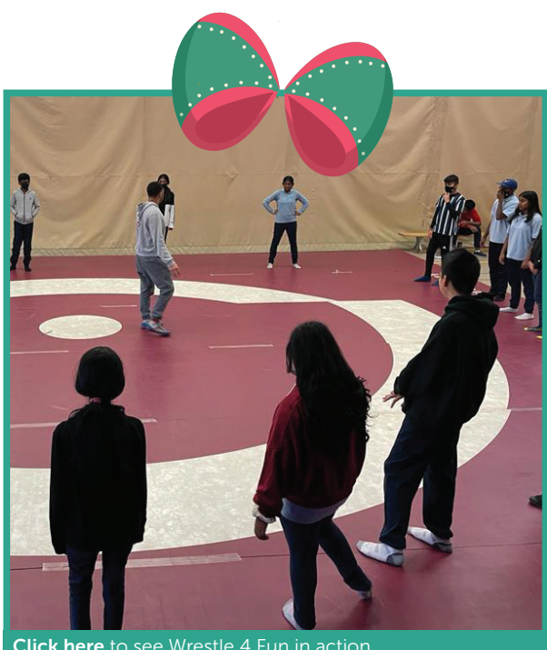
Click here to see Wrestle 4 Fun in action. Video by Arely Torales & Jackson Glasgow